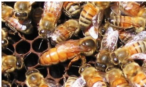
Queen bee surrounded by attendants.

October 21, 6:00pm- HIBA Annual Banquet- Fairview Farms