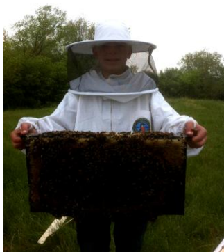
Beekeeping is a great hobby for young and old alike.

Beekeeping is an exciting, family friendly hobby or a full blown career, amateurs and professionals alike meet and discuss the latest in beekeeping, diseases and pests, hive management, honey production and public interest in bees, honey and Mother Nature.