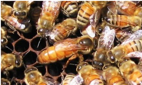
Queen bee surrounded by attendants.